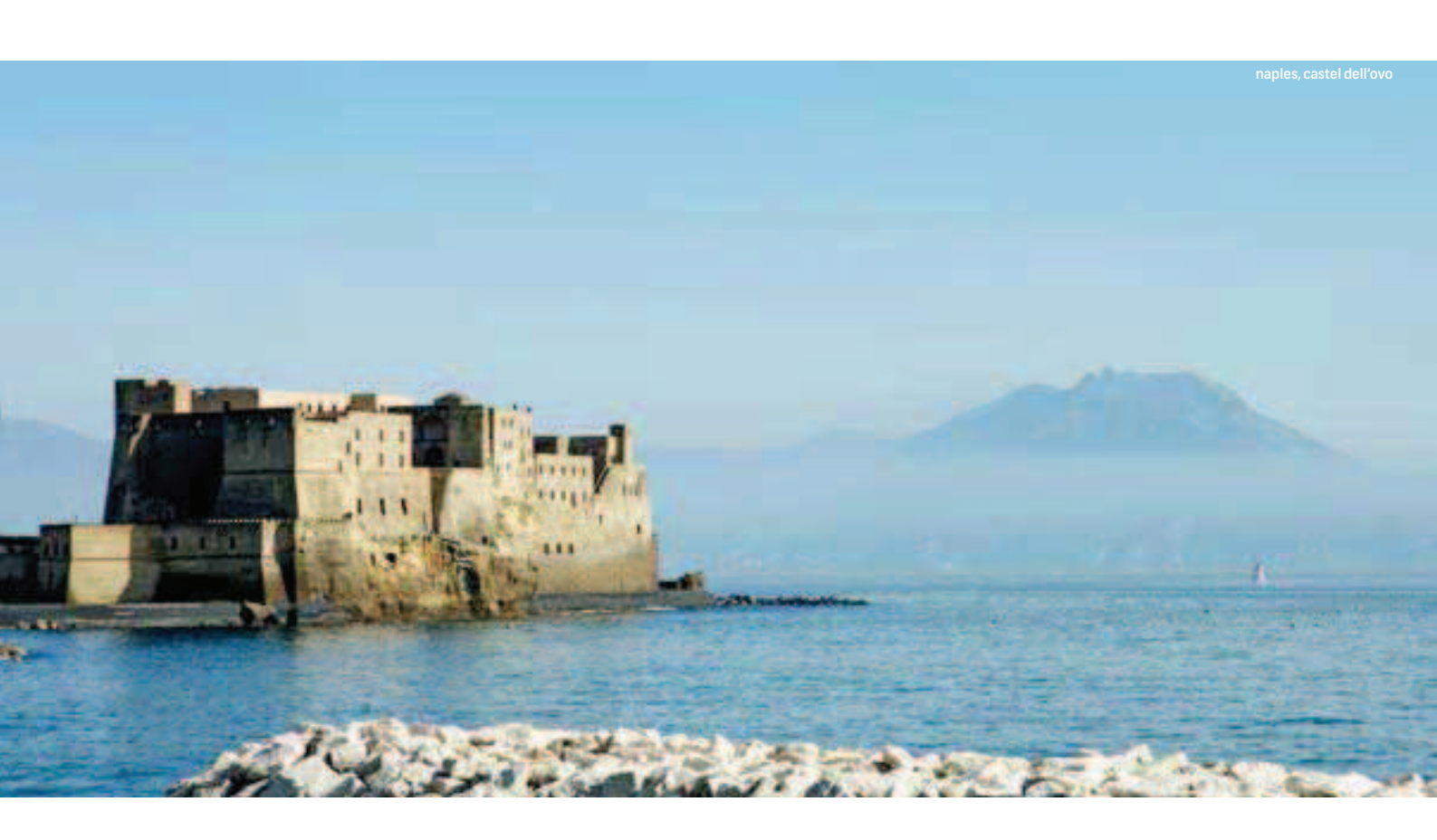
"Oje bella, viénetémne a Positano... addó" ll'nocchie cu 'e suonne 'ncantate se pòmo guardá... Addó" se vótta 'o vverde 'int" o tturchino e na casa se 'ntóppa cu n'ata ca 'ncòppa lle sta" [Napolitan folk song]