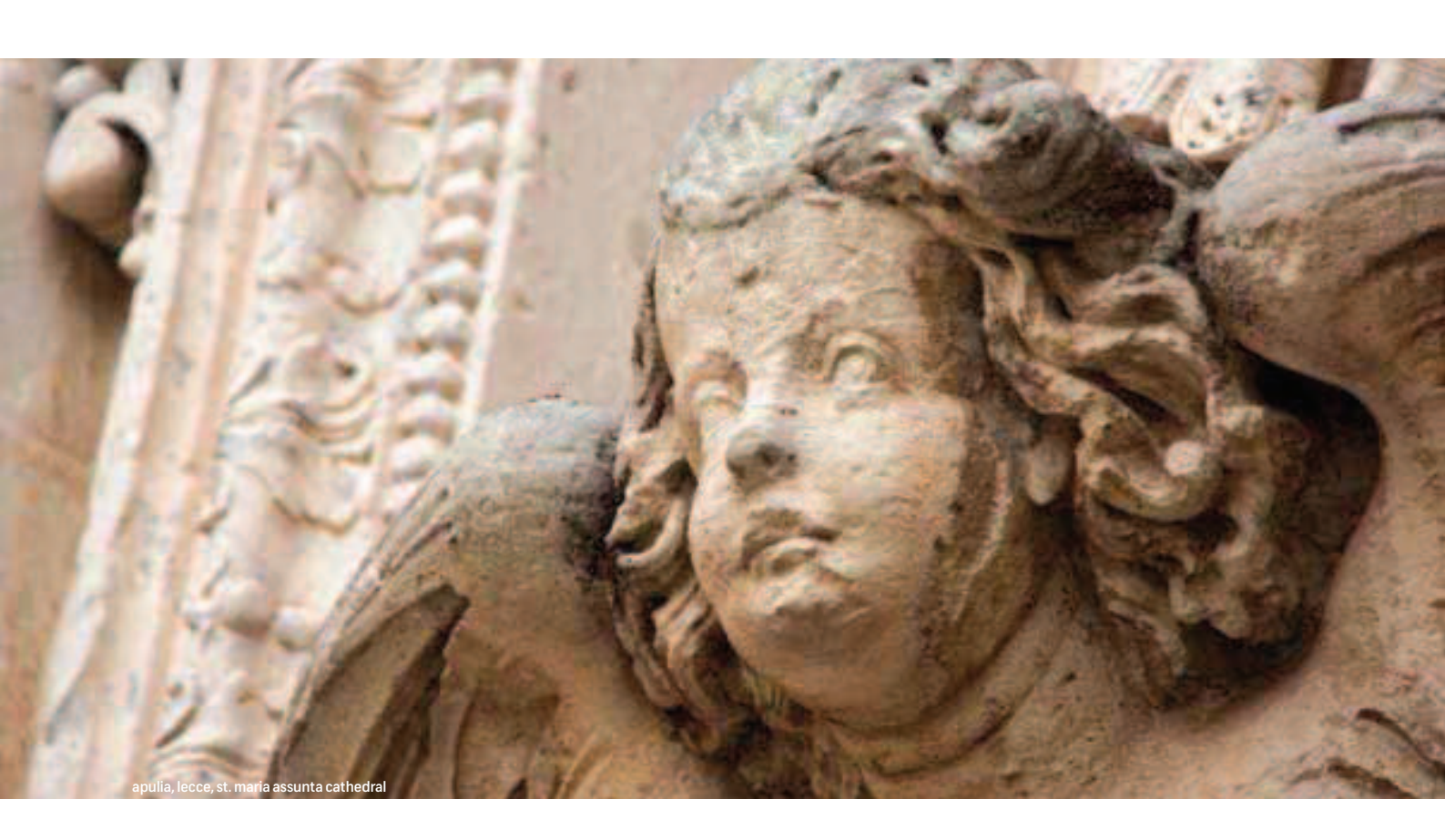
"Gi viti ca se cotula lu pete / quiddhu è lu segnu ca ole ballare, Gi è taranta lassala ballare / ci è malincumia cacciala forte" [U Santu Paulu, Popular song]