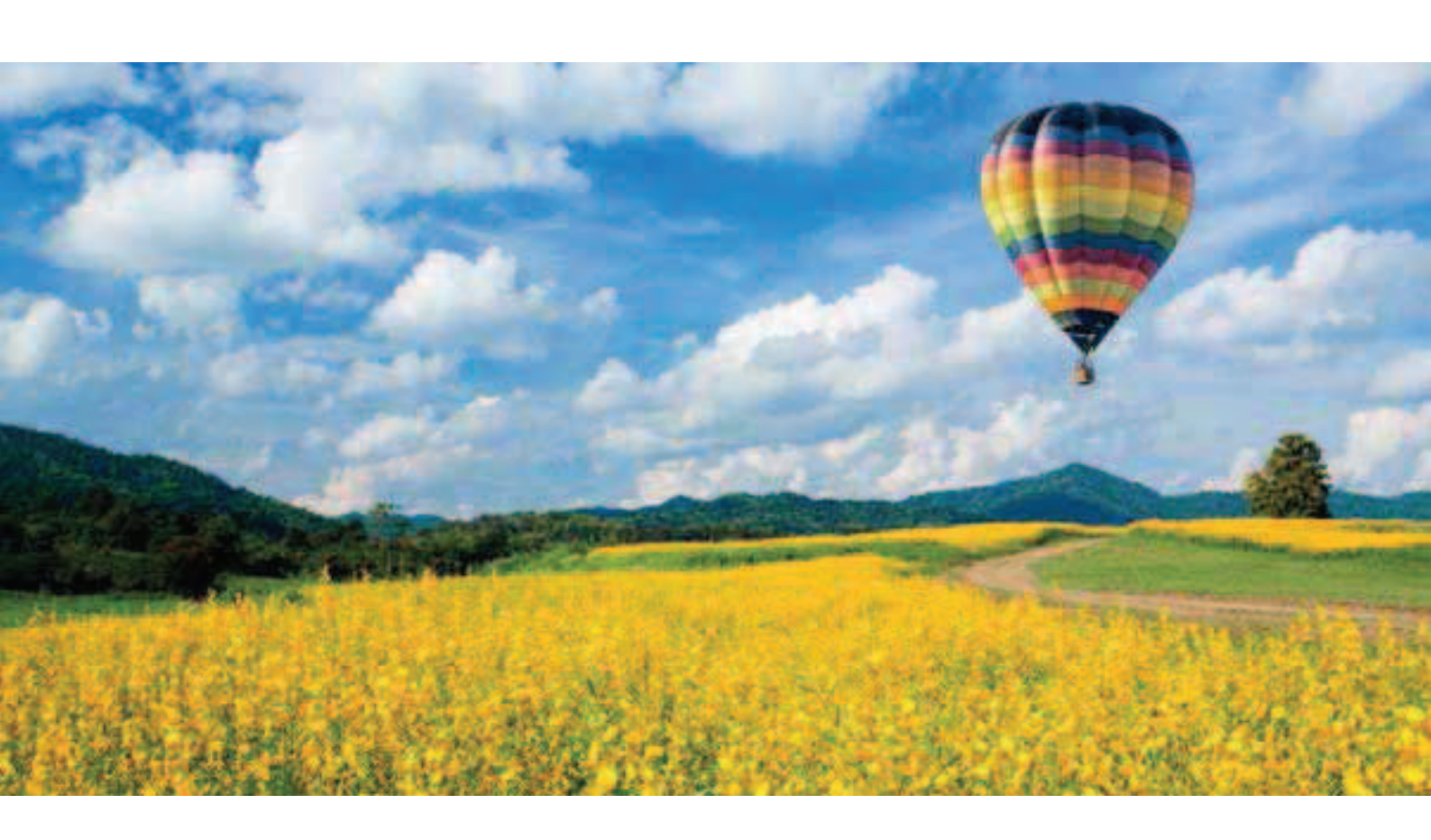
"Guarda il color del sol che si fa vivo, giunto all'umar che da la vite cola" [Dante Alighieri, Italian poet]