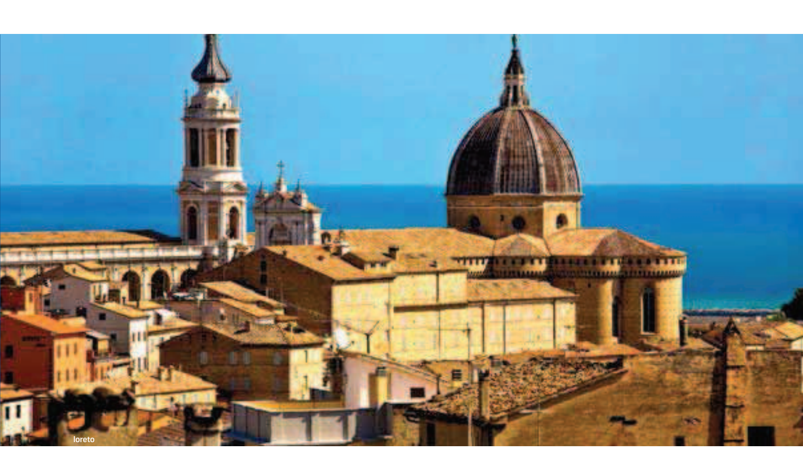
"Sea, hill, mountain, art, culture and good food. One Region ... move experiences"